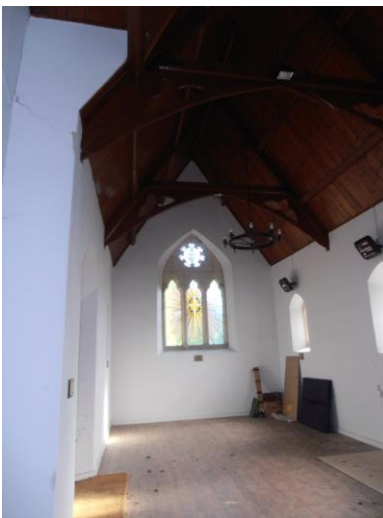
IW Society 2018 Overall Winner Northwood Cemetery Chapels

The aim of the Conservation Awards is to encourage a high standard of planning, architecture and the conservation of buildings and their setting on the Island. Entries will be judged mainly on their quality of design and the work overall and also the visual impact on the environment.